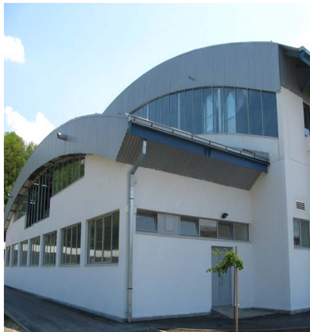
Sportska hala „Vlade Divac“ - Vrnjačka Banja Sports Hall „Vlade Divac“ - Vrnjačka Banja